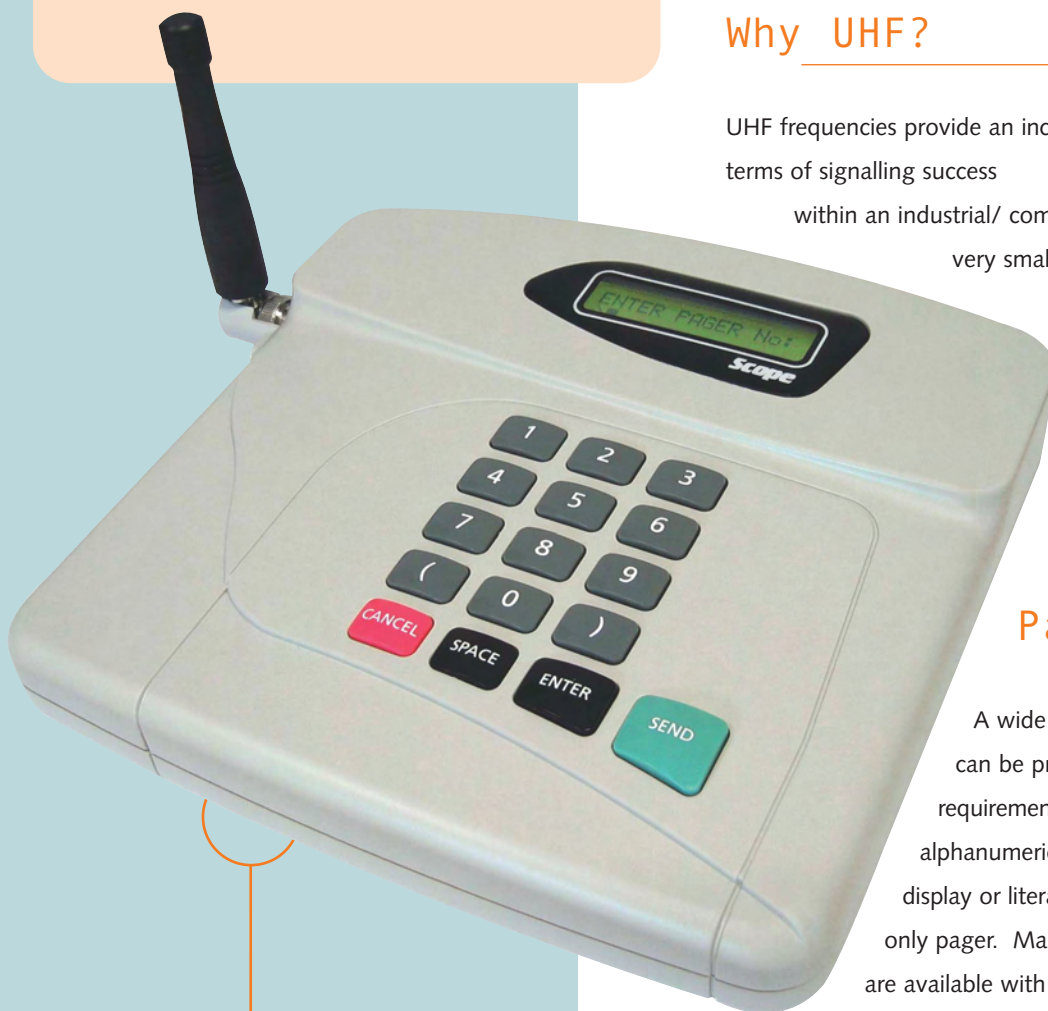
DataPage Lite transmitter

*Note that DataPage Lite can only send numeric characters.